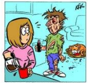
I GAVE THE CAT HER MEDICINE... COULD YOU DRIVE ME TO THE HOSPITAL NOW?

www.vet.ohio-state.edu/indoorcat Great indoor cat info